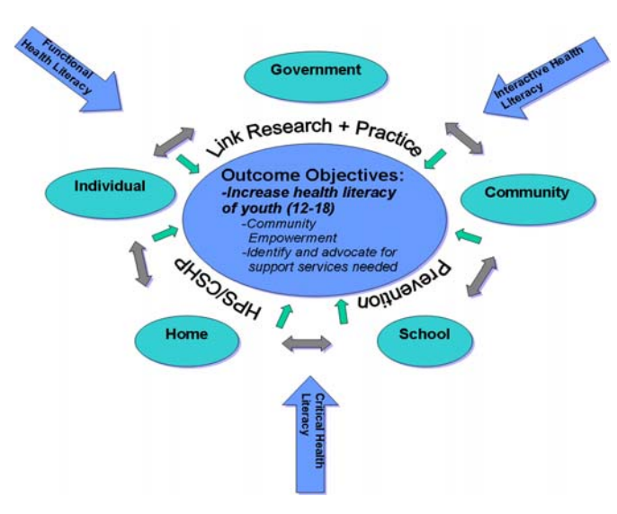
Figure 1. Strategy to Address Youth Homelessness through the Lens of Health Education.

The internationally understood concept of health literacy is broadly defined as "the extent to which people have the ability to obtain, understand, and communicate health information and to assess it" (Rootman & Ronson, 2005, p. S63) - and can be used as a tool to empower youth to create their own positive health outcomes. As shown in Figure 1, Nutbeam (2000) outlines a three-level hierarchy of health literacy: 1) basic/functional health literacy; 2) communicative/interactive health literacy; and 3) critical health literacy. The highest level, critical health literacy, will be discussed as a prevention tool. Critical health literacy is defined as "the cognitive and skills development outcomes which are oriented towards supporting effective social and political action" (Nutbeam, p. 265). This level requires the collaboration of key stakeholders in the promotion of individual and population benefits through the improvement of personal and community/population capacities to act on social and environmental determinants of health. As critical health literacy emphasizes social issues at a population level as well as amendments to policies and practices, it is recommended that it be used to address the international problem of youth homelessness.